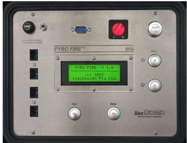
Figure 1: ECU Controller.